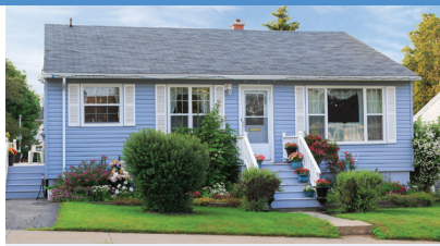
Know Your Home