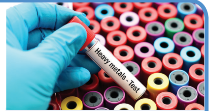
Test Blood for Lead