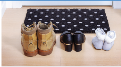
Shoes at Door